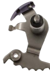
1 st Design

The Rooster Comb provided with this valve body is from the 2 nd design. If you have a 1 st design re-use your original Rooster Comb. No other change (s) required.