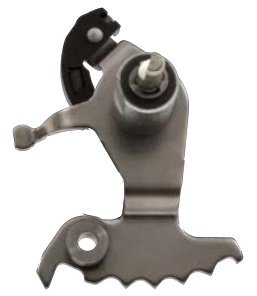
2 nd Design

The Difference-Maker in Remanufactured Valve Bodies